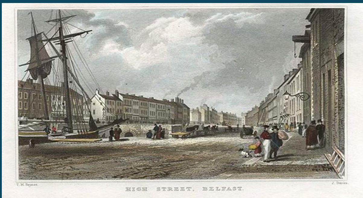
Image: High Street, Belfast c.1831.

In Ireland, cholera's impact was especially severe, with outbreaks producing exceptionally high mortality and exposing the vulnerability of already fragile urban and rural communities. Around forty per cent of those who contracted the disease between 1832 and 1833 died, with mortality rates in some areas reaching as high as seventy-six per cent. In the 1848–49 epidemic, mortality was even higher, as the disease spread through a population severely weakened by the Great Famine and its associated illnesses. When cholera returned in 1853 and 1866, case numbers in Belfast fell markedly, yet, because medical understanding remained limited and treatment practices largely unchanged, mortality rates remained high.